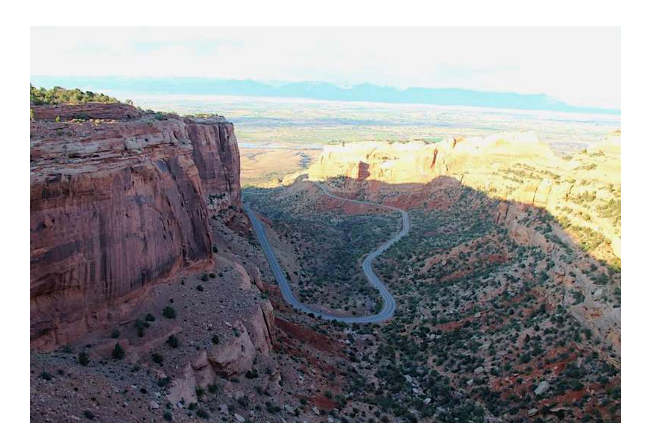
Colorado Counties Mesa, Moffat, Rio Blanco, Garfield & Delta Utah Counties Uintah, Duchesne, Carbon, Emery, & Grand

The Dinosaur Diamond Scenic and Historic Byway - Colorado The Dinosaur Diamond Prehistoric Highway - Utah