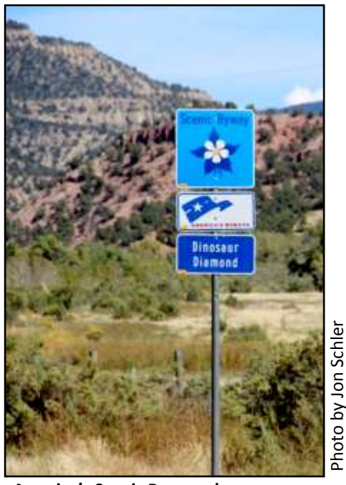
America's Scenic Byway plaque

The organizational challenges of building a stronger wayfinding system are significant. The twenty-six partners are spread widely, cell service is sporadic, print materials are in short supply, and Internet connectivity is nonexistent in many places. Nonetheless, the all-volunteer partnership has begun actively raising funds for marketing and recruiting new members. The plan that follows outlines additional action steps that can improve all elements of the information system that guides travelers through the 512 miles on this dual state National Scenic Byway.