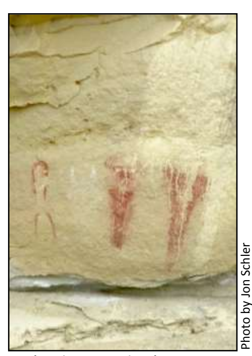
Rock art in Canyon Pintado