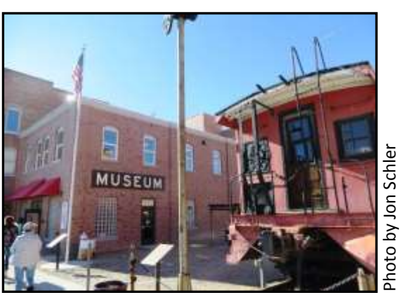
Western Mining & Railroad Museum, Helper, UT