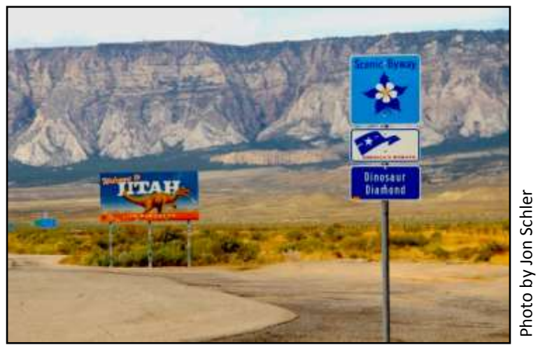
Dinosaur Diamond National Scenic Byway plaques. Utah state line sign west of Dinosaur, CO