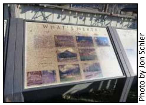
Standardville Bandstand interpretive signage Main Street, Helper, UT, damaged