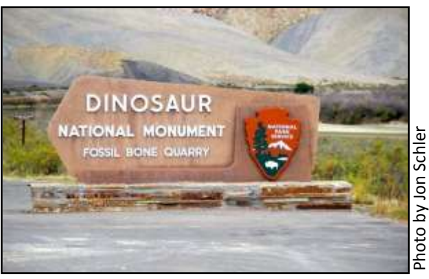
Dinosaur National Monument entry, Jensen, UT

"List the difficulty in finding places, and give people a heads up of what is needed for this trip. You can't just go spontaneously!"