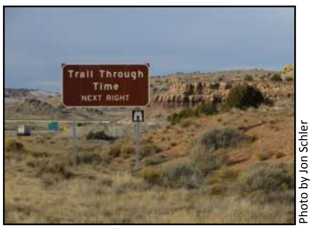
Rabbit Valley Exit off I-70, Fruita, CO