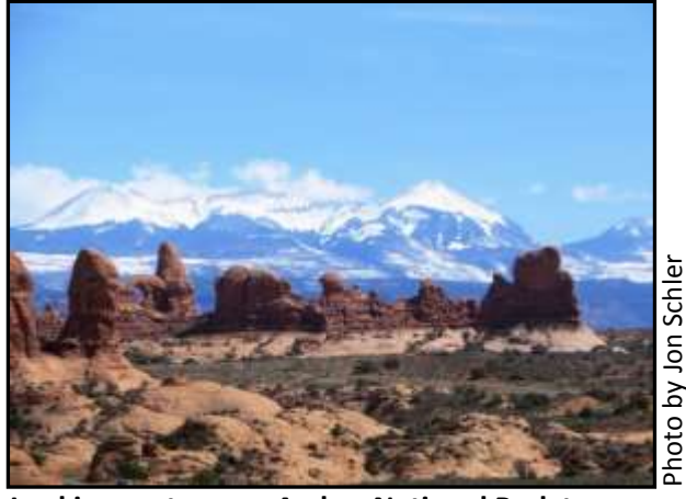
Looking east across Arches National Park to the La Sal Mountain Range from Hwy 191