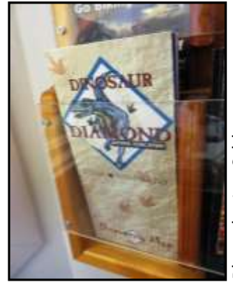
Dinosaur Diamond Scenic Byway brochure

A. Print Tools for Wayfinding. In the short term (summer 2017), raise money from the partners to reprint maps, rack cards and brochures. A majority of the partners want to reprint the four-color 44-page Exploratory Interactive Guidebook, an expensive proposition. Consider updating (Moab Giants needs to be