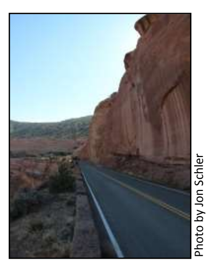
Colorado National Monument, Fruita, CO