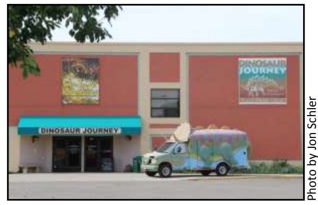
Dinosaur Journey Museum, Fruita, CO