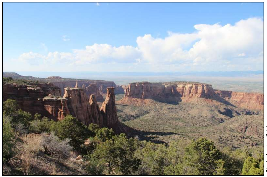
Monument Canyon, Grand Junction, CO looking north