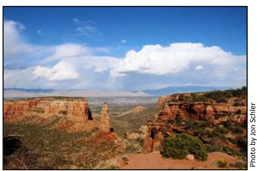
Independence Rock, Colorado National Monument, Fruita, CO