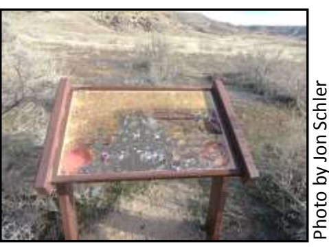
Dinosaur Diamond interpretive signage, Rabbit Valley, west of Fruita, CO